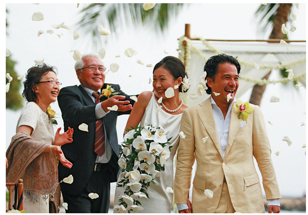
Newlyweds often say they wish they had stressed less on the day and relaxed a bit more. Embracing technology and going online to make use of helpful tools can change all that.

Chau's top tip for the whole planning exercise is to "know when the sun will set" on the appointed