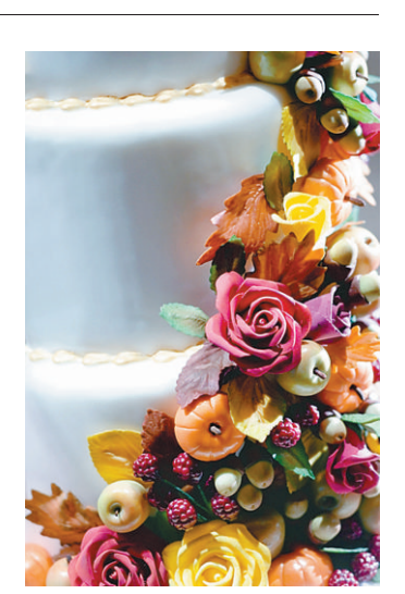
Sugar art detailing on a Mandarin Oriental wedding cake.

such as yuzu and coconut, carrot and lemon, yoghurt with mixed berries, and lime and mint. "Flavours are a personal choice, but most of the choices